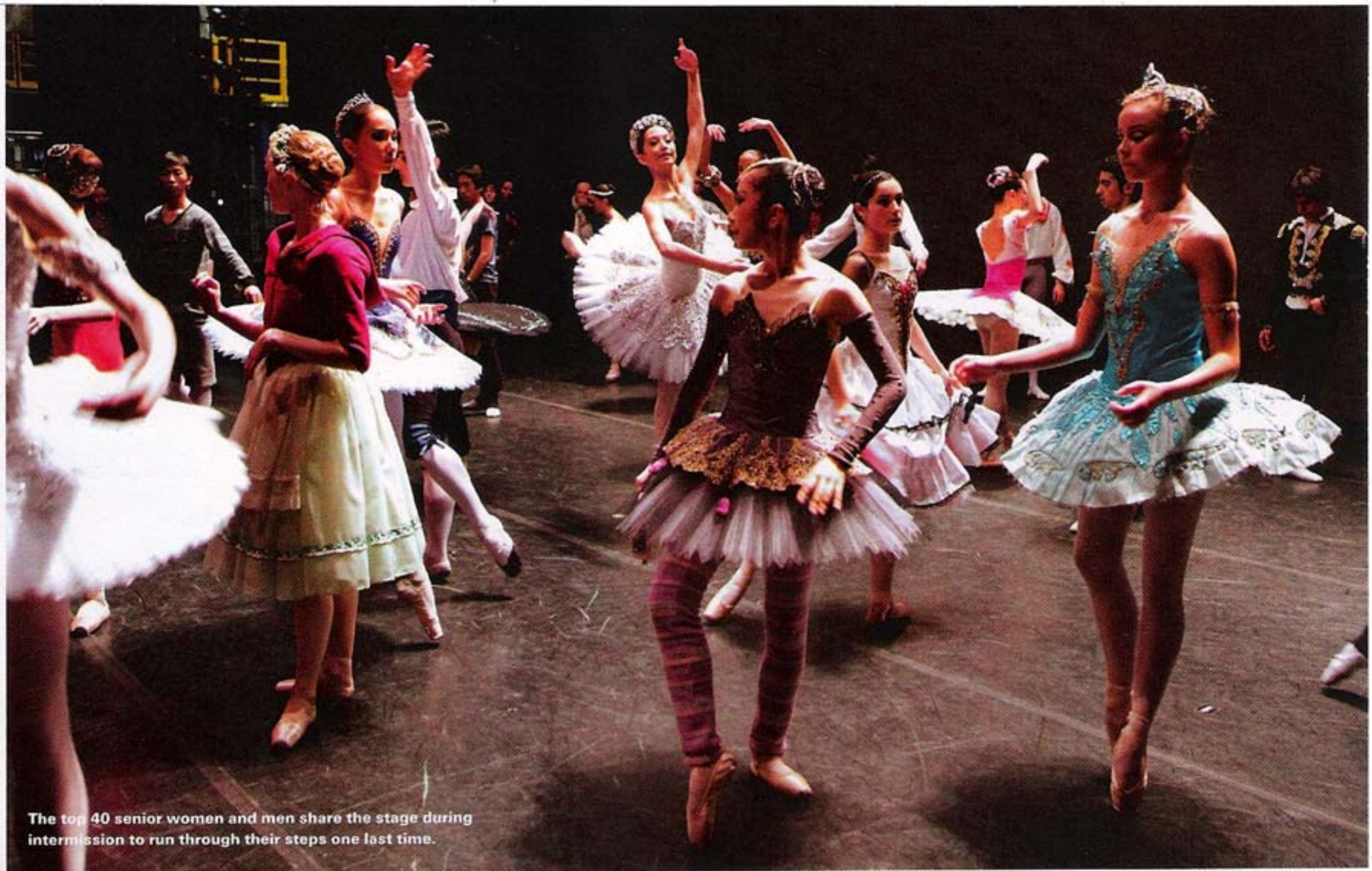
The top 40 senior women and men share the stage during intermission to run through their steps one last time.

"I enjoyed every second onstage—to find out I won was extraordinary! But it has not made me think for one moment that I'm good enough."